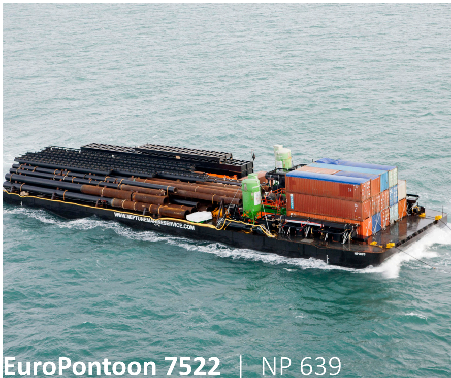
EuroPontoon 7522 | NP 639

Neptune has got various vessels and pontoons available for sale or charter. To fulfil your operational demands, Neptune offers a wide range of deck equipment, including accommodation units, mooring equipment and cranes.