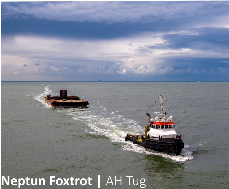
Neptun Foxtrot | AH Tug

The robust, efficient and flexible design of the AH Tug makes it one of the best vessels for anchor handling, dredging support and long distance towages. The AH Tug can be adapted to perfectly fit any project within a short time.