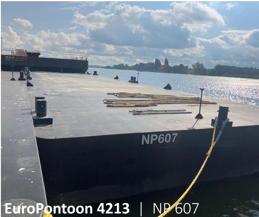
EuroPontoon 4213 | NP 607

Neptune has got various vessels and pontoons available for sale or charter. To fulfil your operational demands, Neptune offers a wide range of deck equipment, including accommodation units, mooring equipment and cranes.