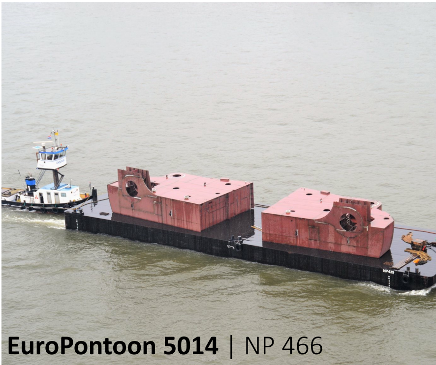
EuroPontoon 5014 | NP 466

Neptune has got various vessels and pontoons available for sale or charter. To fulfil your operational demands, Neptune offers a wide range of deck equipment, including accommodation units, mooring equipment and cranes.