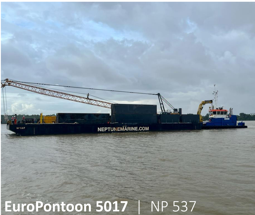
EuroPontoon 5017 | NP 537

Neptune has got various vessels and pontoons available for sale or charter. To fulfil your operational demands, Neptune offers a wide range of deck equipment, including accommodation units, mooring equipment and cranes.