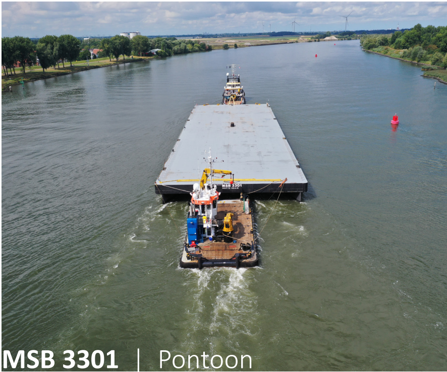
MSB 3301 | Pontoon